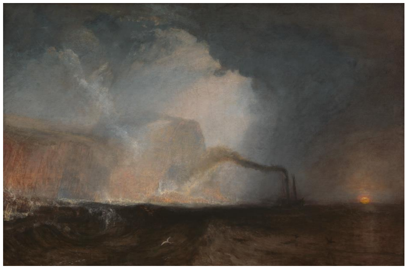
Figure 9. J.M.W. Turner, Staffa, Fingal's Cave, 1832

Atmosphere: Nature's Processes as Objective Analytical Phenomena