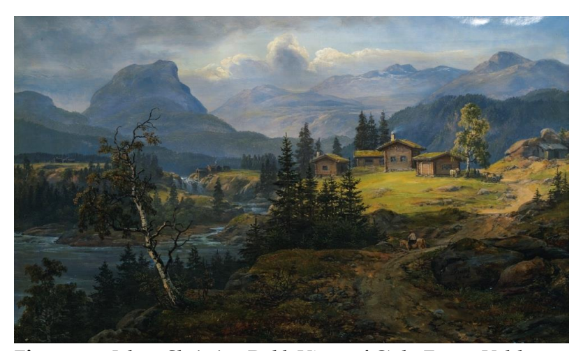
Figure 15. Johan Christian Dahl, View of Øylo Farm, Valdres, 1850

View of Øylo Farm, Valdres (see Figure 15) is one of multiple large-scale paintings that Dahl completed in his later years despite the lack of purchasers. Detached from commercialistic pressures, these paintings showed Dahl's true feelings for the landscapes of his home country. Compared to his earlier Nordic scenes, View of Øylo Farm, Valdres has a greater sense of depth, which is created by the receding tonality of the mountains in the distance. For his Norwegian paintings, Dahl generally preferred more distant views than focus on landscape features. For example, the waterfall in View of the Feigumfossen in Lyster Fjord (1849) is simply a part of the habitat where goats in the foreground live. Dahl's wider views were chosen to showcase the splendour of nature through expansive landscapes. While the landscape of View of Øylo Farm, Valdres is a composite of mountains (background), a flowing stream and a specimen birch tree (left), a group of conifers (midground), a rugged path leading to the farming huts (right), and the people and horses living at the farm, each element is painted convincingly.