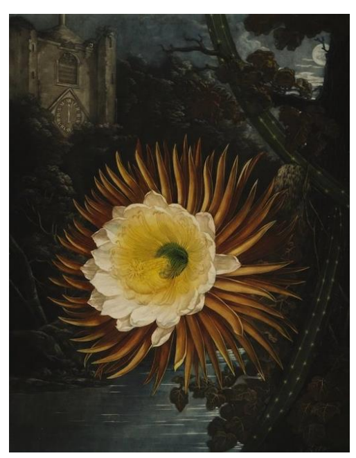
Figure 5. Philip Reinagle and Abraham Pether, The Night-Blowing Cereus, 1800

wallpaper-like background for a more whimsical feel.