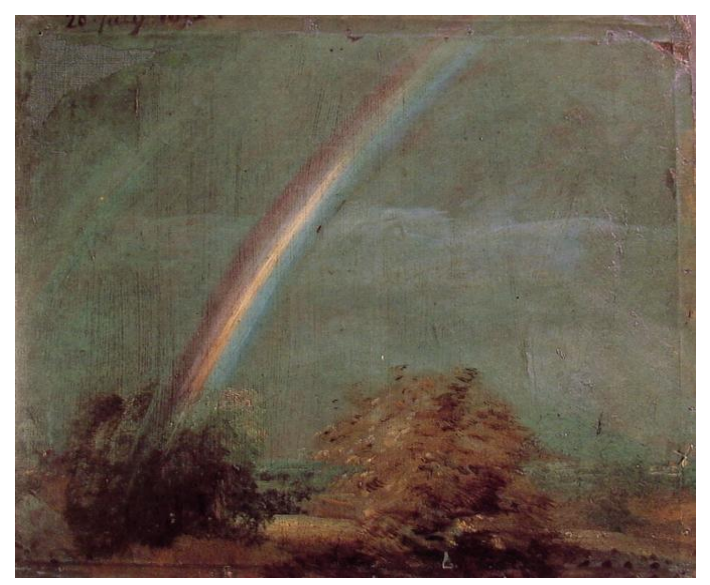
Figure 10. John Constable, Landscape with Double Rainbow, 1812

Rainbows were another atmospheric feature that intrigued Constable and other painters. As a traditional symbol of Christian faith, several Romantic paintings included rainbows as allusions to the divine. In Friedrich's Mountain Landscape with Rainbow (c. 1810), the rainbow is a radiant arc across the expanse of dark sky, symbolising the Christian promise of eternal afterlife. Turner's Rainbow over Loch Awe (c. 1831) is more suggestive of the symbolic halo, as it illuminates off the surface in an unnaturally tight radial arc. Constable, who went as far as to study prisms and the optics of light, still considered the concept of nature as a Godly creation. For Constable, painting nature accurately meant representing God's creation truthfully. Painting nature well meant to "understand it from every point of view, see it in scientific terms, and see it as the product of a moment of special intensity." Instead of a symbol of divinity, his Landscape with Double Rainbow (see Figure 10) portrays nature as it is –the delicate blending of colours and its effect of transient light. To Constable, painting was both a science and an expression of feeling. For the delicate blending of feeling.