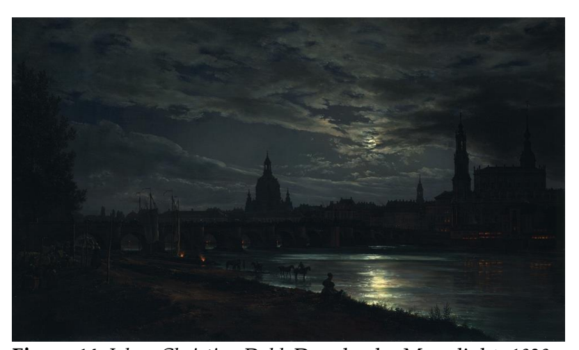
Figure 14. Johan Christian Dahl , Dresden by Moonlight, 1839

Unlike Friedrich's symbolic symmetry, Dahl often chose standard "postcard" views for his landscapes. The view used in his 1839 version of Dresden by Moonlight (see Figure 14) was taken from a familiar vantage point across the river that is almost identical to Bernardo Bellotto's (1721-1780) View of Dresden from 1759.<sup>73</sup> In Bellotto's version, the details of Dresden's architecture are displayed in clear daylight. Dahl's version has a similar setup but is distinctly romanticized. The dimly lit Baroque architecture instills a sense of nostalgia. It is already dark, but the people on the bank are still working as if it were daylight. <sup>74</sup> The silhouettes of horses wading in the water and the figure of a woman sitting contemplatively at the bank emphasize the peaceful mood. However, the partially cloud-covered moon and its dazzling reflection on the water are the main highlights of the painting, creating a poignant romantic aura. Dahl painted numerous paintings of Dresden, but almost all were set under a moonlight setting. Although Dahl examined the moon through many sketch studies, he was mostly interested in the ambiance that could be generated in night scenes.