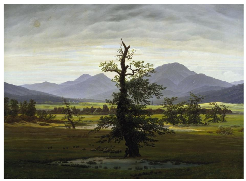
Figure 7. Caspar David Friedrich, Village Landscape in Morning Light (Lone Tree), 1822