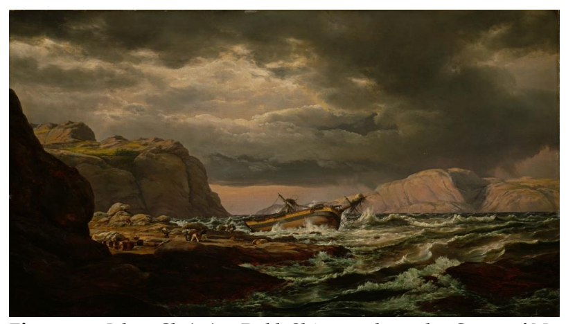
Figure 13. Johan Christian Dahl, Shipwreck on the Coast of Norway, 1832

Although Dahl was a son of a fisherman, he did not start painting seascapes until the 1820s when he was already an established artist. Unlike the common nautical prints of his time, Dahl's emphasis was on the contextual landscape instead of the ship. 72 Shipwrecks were common subjects in his paintings. Shipwreck on the Coast of Norway (see Figure 13) shows a detailed scenario that takes place on a rocky coast. The crevices and formations of the mid-ground and background rocks are portrayed while the foreground rocks are in shadow, illuminating the wrecked ship like a theatrical setup. Waves of water and storm clouds are painted in extreme detail with careful use of colour. A sense of hope is felt as a glimpse of light breaks out behind the clouds. Here, like many of Dahl's paintings, the figures are anecdotal. While the boy and his dog were lone survivors in his 1819 painting Morning after a Stormy Night, here they sit quietly to the side as the men work diligently to recover their belongings from the wreckage.