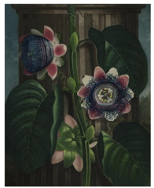
Figure 6. Peter Henderson, The Quadrangular Passion Flower, 1802

tree is a sacred symbol.<sup>50</sup> Certain Romantic theories of the world's origin help to put the importance of the tree in perspective. In the theory of Bildungstrieb , Johann Friedrich Blumenbach described a life force intrinsic to organisms that gave potential to new species.<sup>51</sup> This natural world had divine origins but was self-organized. Alternatively, Johann Gottfried Herder had a similar cosmological teleology but with a specific end goal: "The whole development of the world, in Herder's religious cosmology, arched with deliberate intent toward the crowning achievement, human nature and the perfection of humanity."<sup>52</sup>