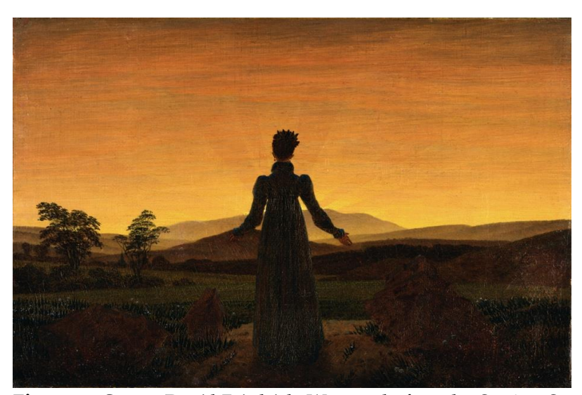
Figure 2. Caspar David Friedrich, Woman before the Setting Sun, c.1818

same way we see paintings. The figures, symmetrically placed in the frame, obstruct the view of the scene ahead. We unavoidably identify with these solitary figures in front of infinite nature.<sup>30</sup> In contrast, Friedrich's Monk by the Sea (see Figure 3) overwhelms by inverting illuminated nature with dark mystery, as the lone monk stands diminutively in comparison to the expansive sea. In all cases, the sublime is found in the revelation of human presence against infinite nature.