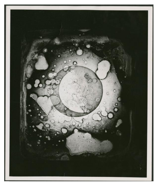
Figure 12 . John William Draper , Moon Daguerrotype, 1840