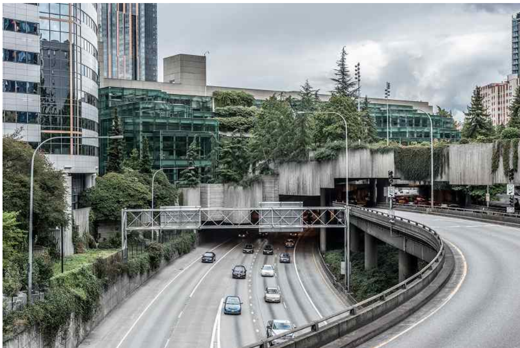
Figure 6. Freeway Park View from the I-5

Freeway Park was meant to be designed for everybody, for the pedestrian travelling through the park to get from one side to the other, for the park goers but also the motorist driving by, scaling down the high impact of the freeway.