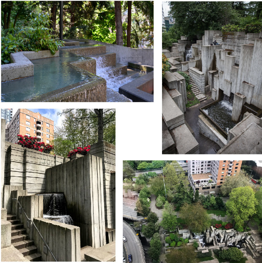
Figure 7. Top Left: Fountain of Pigott Corridor; Top Right, Bottom Left: “Canyon” Fountain of Freeway Park; Bottom Right: Aerial View of Main Plaza of Freeway Park