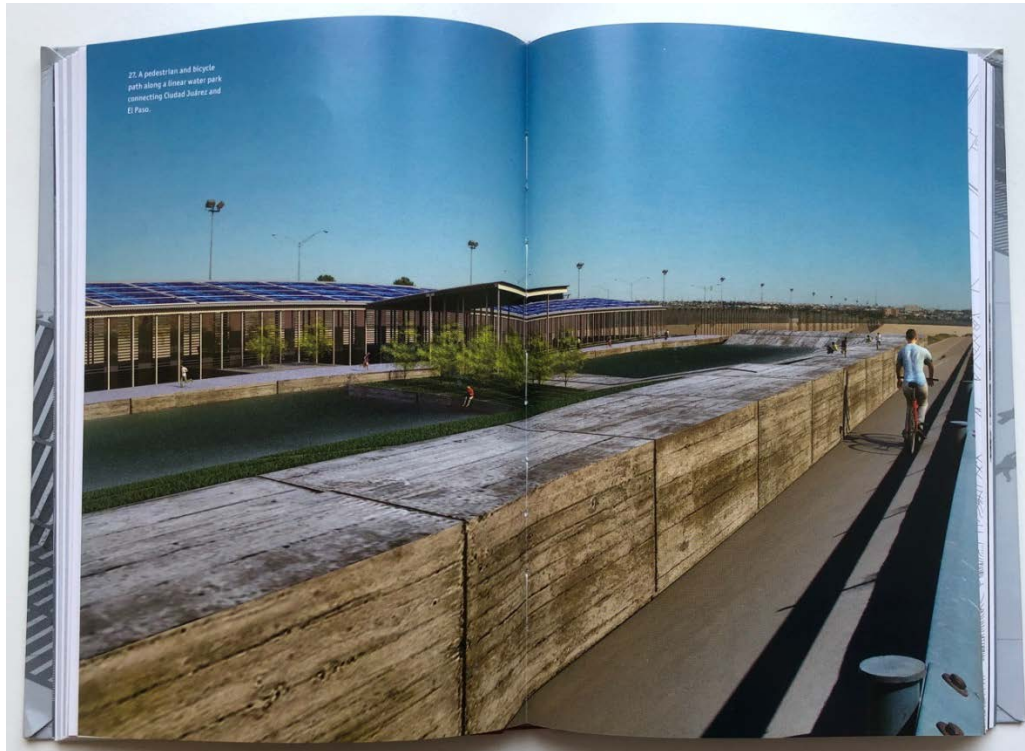
Figure 3. Hydro Wall

Source: Ronald Rael, Borderwall as Architecture .