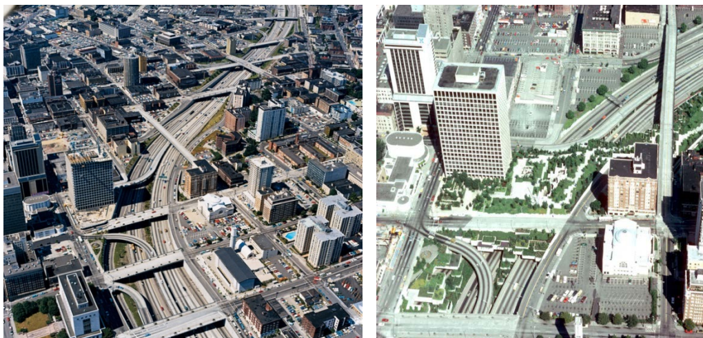
Figure 5. On the Left: Interstate 5 before the Highway Lid and Freeway Park. On The Right: Highway Lid and Freeway Park

In this regard, it is quite obvious to notice how the construction of Highways and Freeways has been interpreted as creating physical barriers that separate portions of city and community relationships. An emblematic example can be found in the city of Seattle and the unfortunate collocation of Interstate 5 (Figure 5).