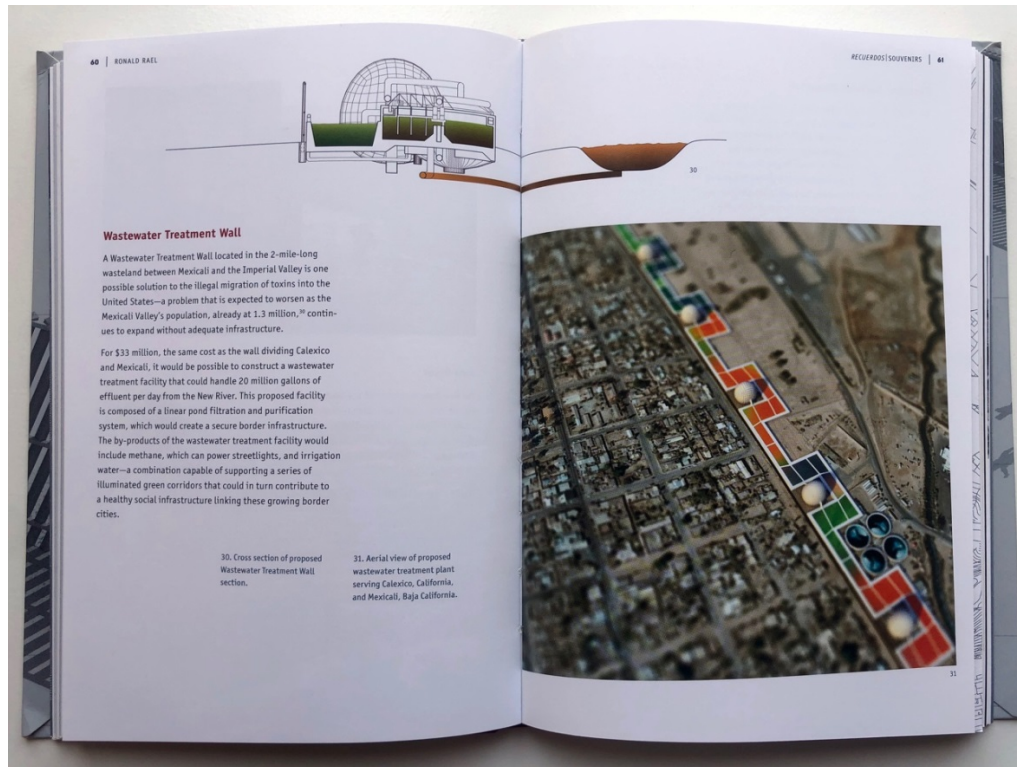
Figure 4. Water Treatment Wall

purification system that, as mentioned before could also act as a secure border infrastructure. Additionally, some of the by-products of the treatment facilities, like methane, could be used to power streetlights, and irrigation water. This could allow for the creation of a network of illuminated green corridors that could link and encourage healthy social infrastructure between the growing border cities.